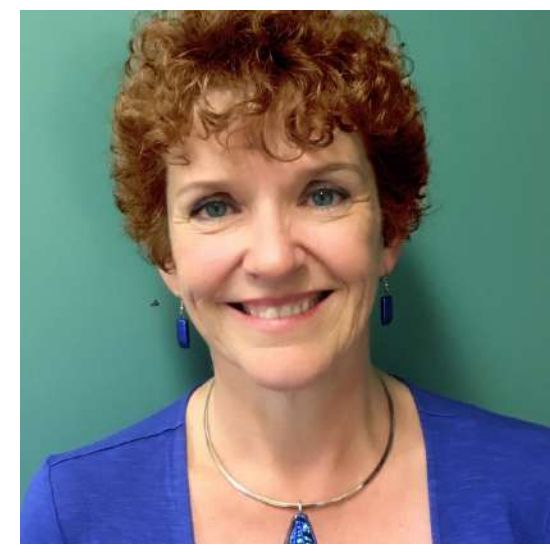
Karen Walker Australia