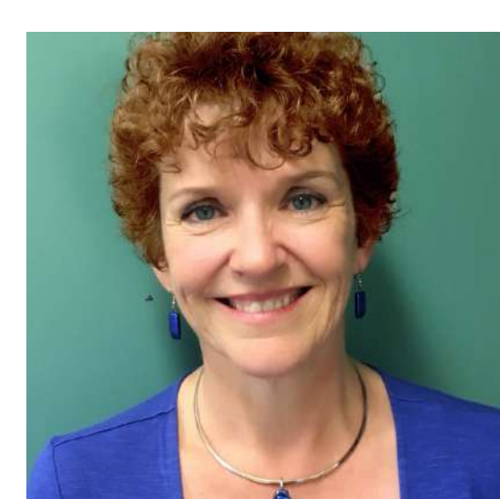
Karen Walker Australia