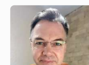
Ricky Dippenaar South Africa